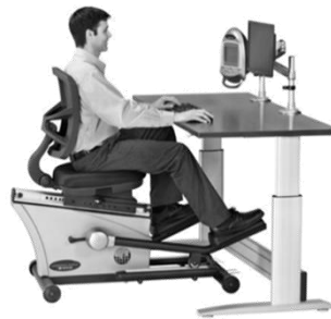
Figure 1. LifeBalance Station.